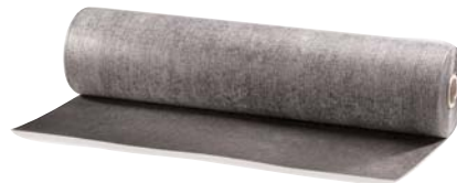
GlasPave50 is available in roll length of 78.75 inches to 120 yards making installation fast and easy.

For more information on the GlasPave Product or other Tensar Systems, call 800-TENSAR-1 , visit www.tensar-international.com or e-mail info@tensarcorp.com .