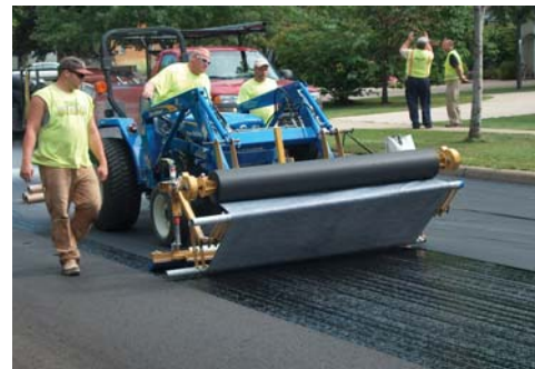
GlasPave50 is easy to install and does not shrink like conventional paving fabrics.

Due to the ability of the fiberglass matrix to resist asphalt's high application temperatures, GlasPave50 will not shrink or change dimensions when hot mix asphalt comes into contact with it as opposed to polypropylene fabrics. This feature eliminates the risk of premature slippage or loss of bond.