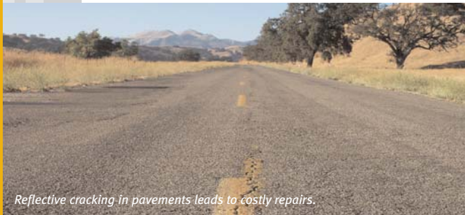
Reflective cracking in pavements leads to costly repairs.

The fiberglass matrix in GlasPave50 pavement mat provides significantly greater tensile strength at low strain compared to conventional paving fabrics and