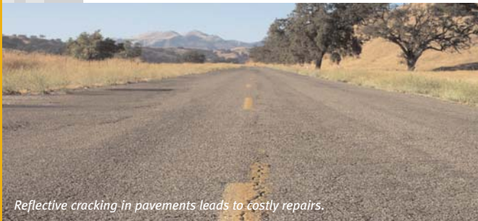
Reflective cracking in pavements leads to costly repairs.

The fiberglass matrix in GlasPave50 pavement mat provides significantly greater tensile strength at low strain compared to conventional paving fabrics and