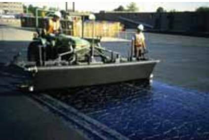
| With the tack coat already sprayed on, the paving fabric is now placed over this substantially cracked surface.

roads, he referred to pavement evaluation reports gathered between 1994 and 1996. Then he used characteristic pavement degradation curves for Greenville County to project what the PCI was at the time the roads were actually repaired.