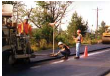
Quality control measures are critical for all roadway projects.

Many counties, municipalities, and DOTs have a policy similar to Greenville County's "worst-first" strategy.