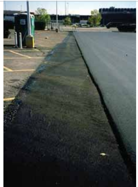
| Left to right: tack coat, paving fabric, overlay.

The improvements included in the study were part of a program called