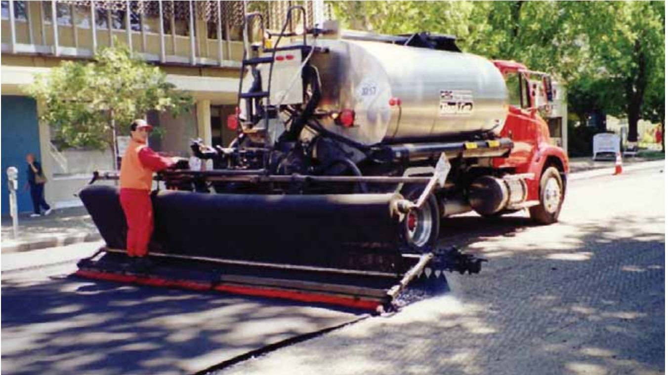
Here, a paving fabric laydown apparatus is attached to the tack coat truck, thus facilitating simultaneous tack coat spraying and paving fabric application.

PCI ratings and would ascertain that consistent methods were used.