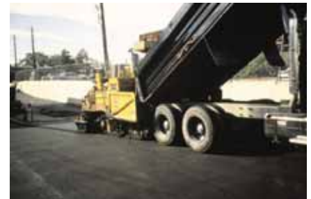
| With the paving fabric installed, an asphalt overlay is completed.

• For roads with a PCI above 50, a simple asphalt overlay is about equal to a fabric/overlay system in performance and cost-effectiveness. (When the paving fabric interlayer and overlay is as