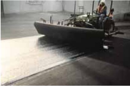
| Installation of the paving fabric over the tack coat.

roads, he referred to pavement evaluation reports gathered between 1994 and 1996. Then he used characteristic pavement degradation curves for Greenville County to project what the PCI was at the time the roads were actually repaired.